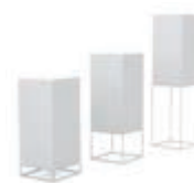
VELA High Lamp

15¾" x 15¾" x 35½" 15¾" x 15¾" x 43¼" 15¾" x 15¾" x 59¾"