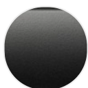
Matt painted black nickel X101