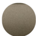
Matt painted bronze X100