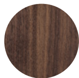
T135 Canaletto Walnut