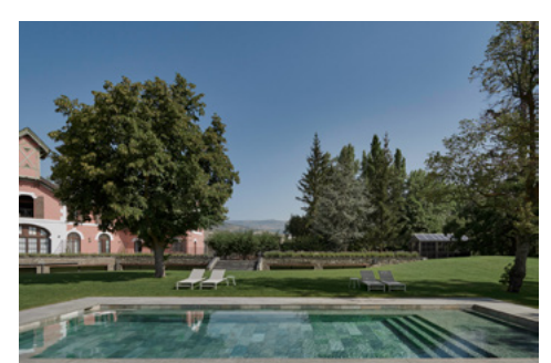
Hotel Torre del Remei (Cerdanya, Spain)