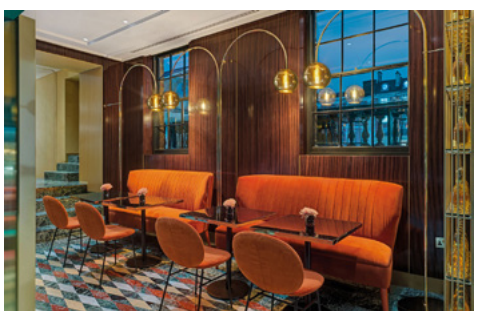
VyTA Covent Garden (London, United Kingdom)