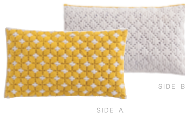
YELLOW - WHITE

Yellow-White 142115 Cel-Light grey 142119 Rose-Light grey 142123