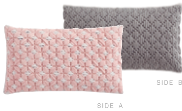
ROSE - LIGHT GREY