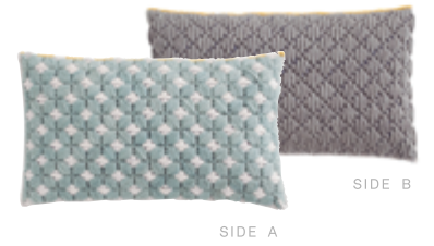
CELADON - LIGHT GREY