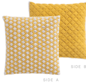
YELLOW - YELLOW